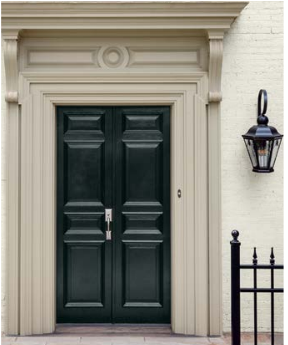
Blackwatch Green 19-17