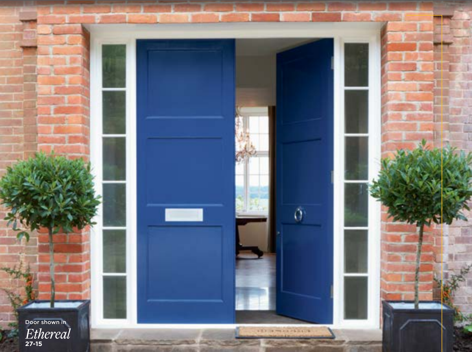
Door shown in Ethereal 27-15